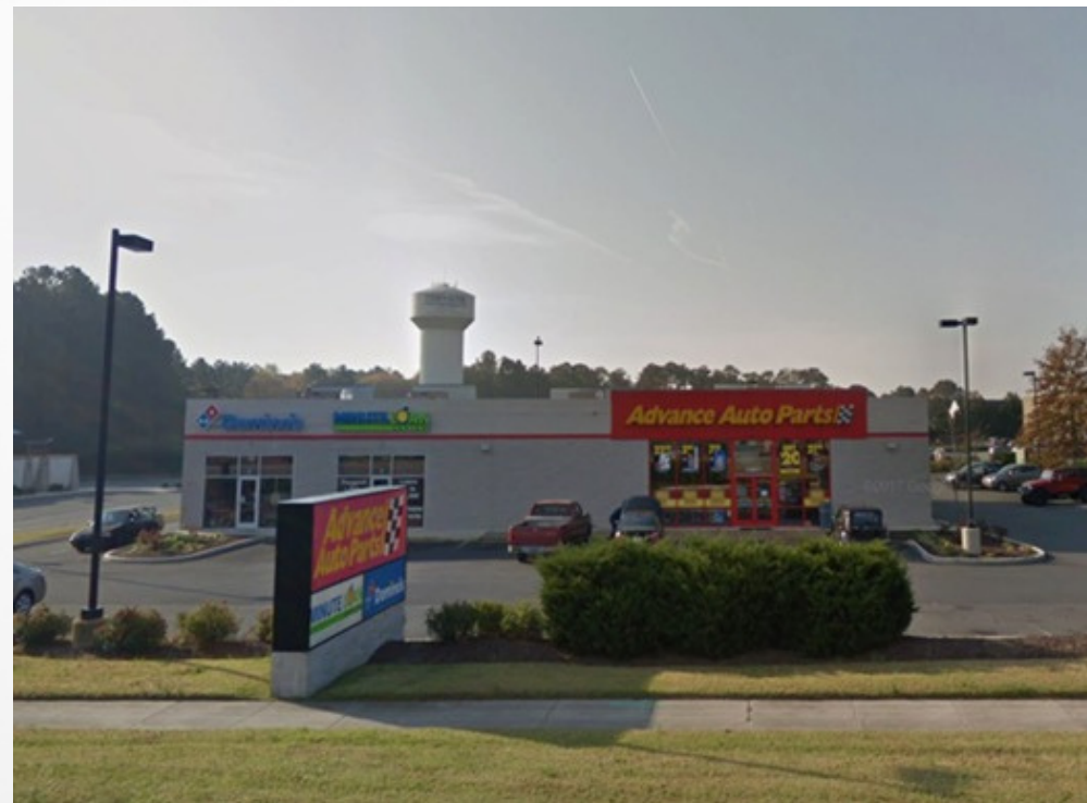
LEWES, DE Advance Auto, Domino's Pizza, Minute Loan New Construction Multi-Tenant NNN