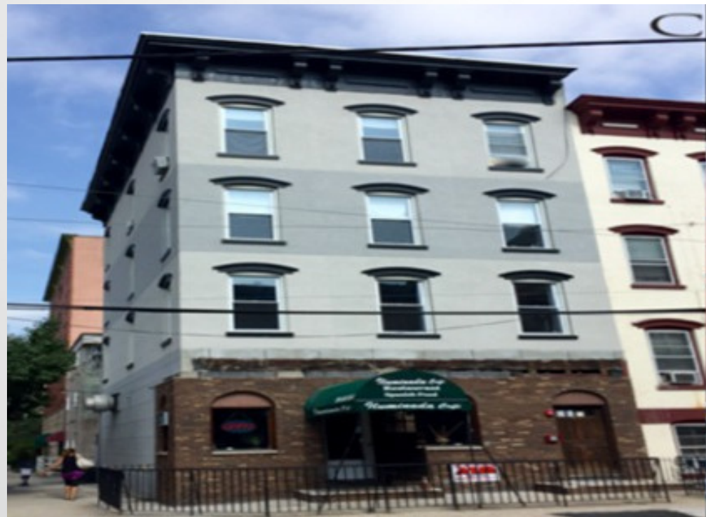
HOBOKEN, NJ 6 Unit Corner Mix