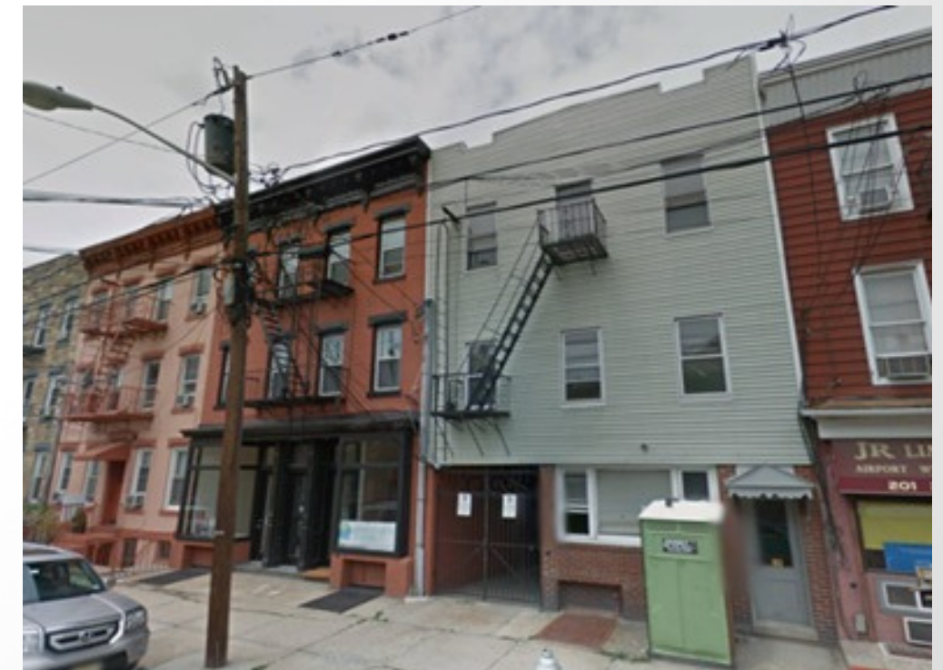
JERSEY CITY, NJ 9 Unit Mixed Use