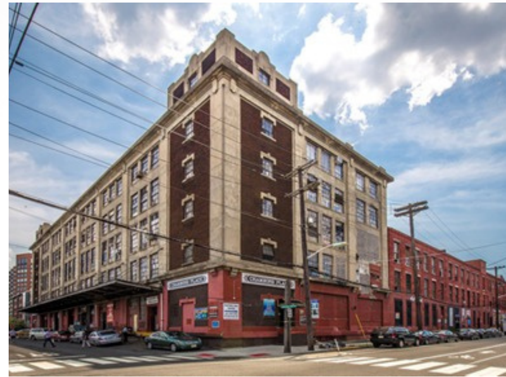
HOBOKEN, NJ 200,000 SF Industrial Property