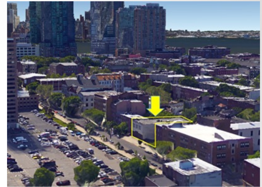
JERSEY CITY, NJ Warehouse Development Opportunity