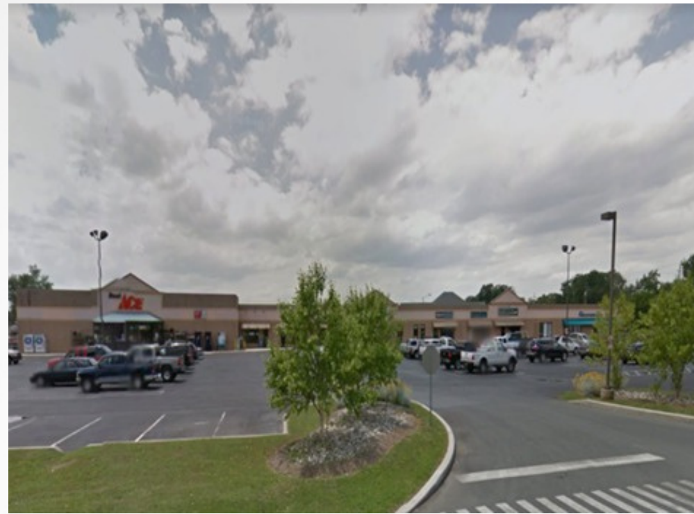
MILTON, DE Clipper Square Retail Center 40,000 SF Shopping Center