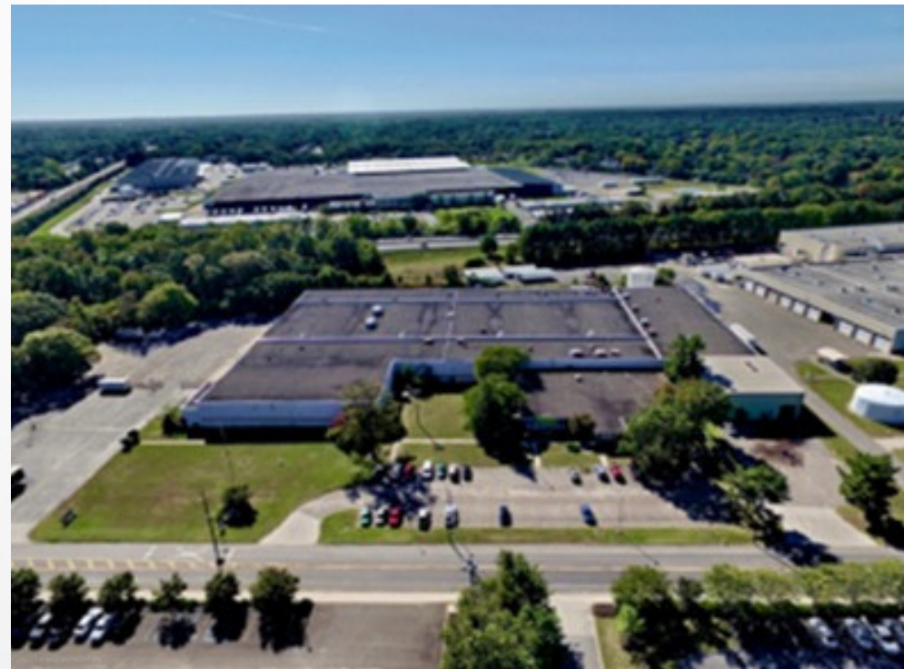
BARRINGTON, NJ 140,000 SF Industrial Property