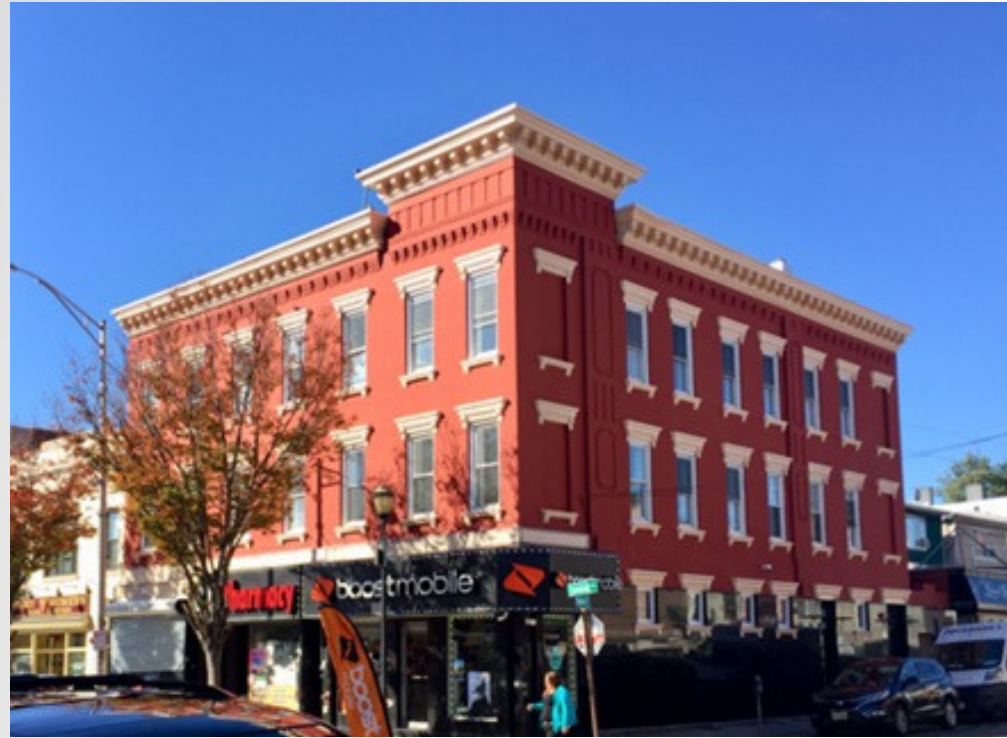
JERSEY CITY, NJ 17 Unit Corner Mix