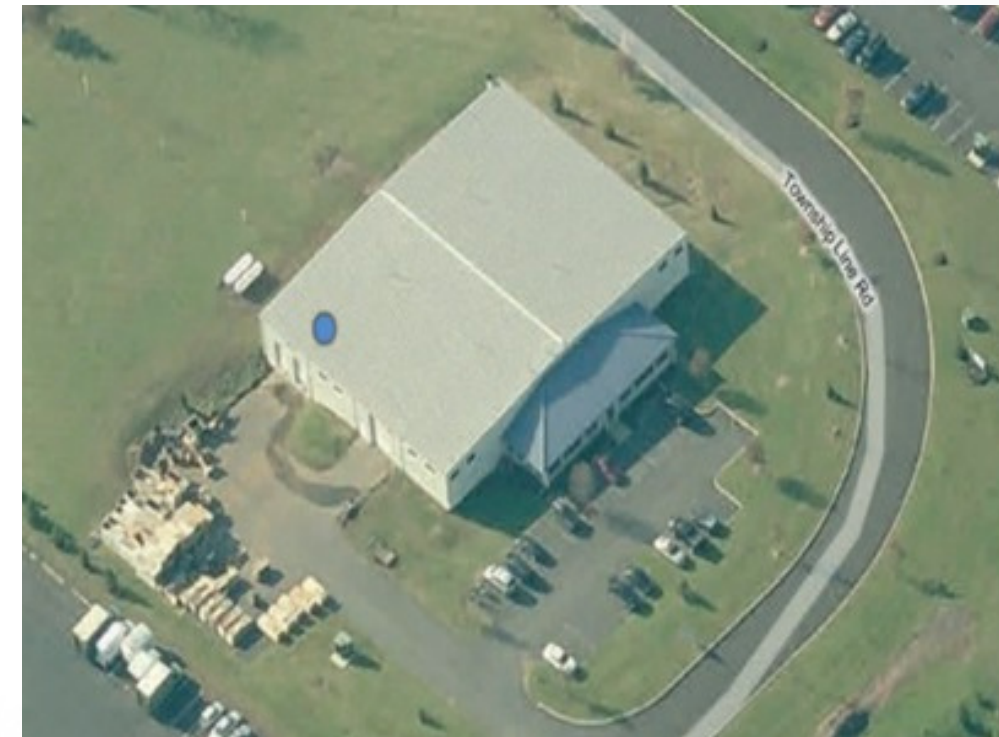
SCHWENKSVILLE, PA 20,000 SF / 3.9 Acres