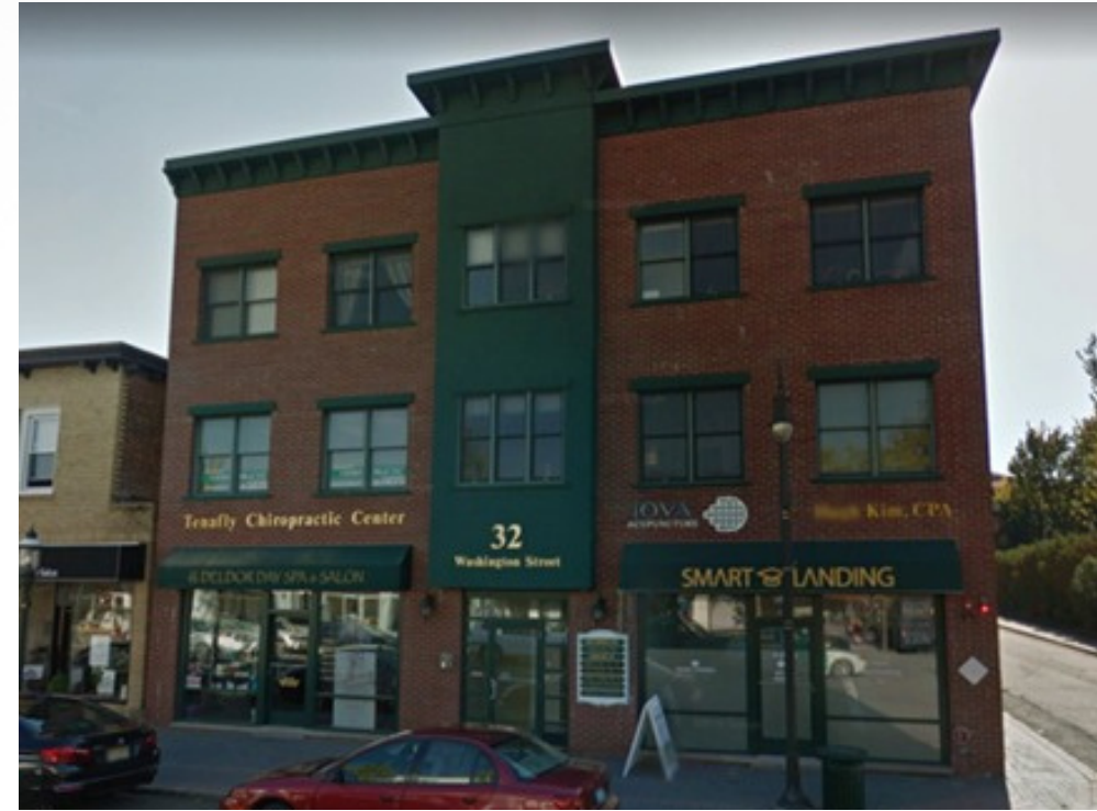
TENAFLY, NJ 15,000 SF Mixed/Retail/Office/Residential