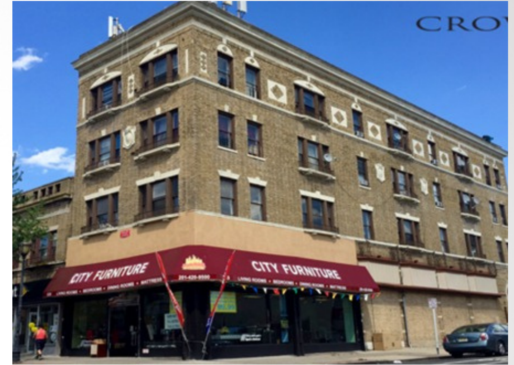
JERSEY CITY, NJ 12 Unit Value Add