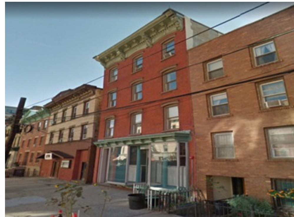
JERSEY CITY, NJ 4 Unit Value Add