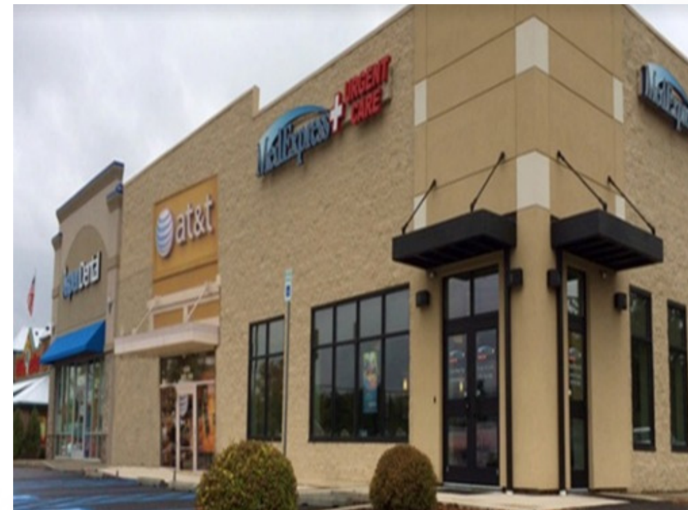
SELINGROVE, PA Susquehanna Plaza – Value Add Retail Strip Center MedExpress, AT&T, Aspen Dental