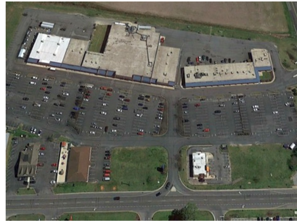
HARRINGTON, DE Harrington Midway Shopping Center 100,000 SF Grocery Anchored Center