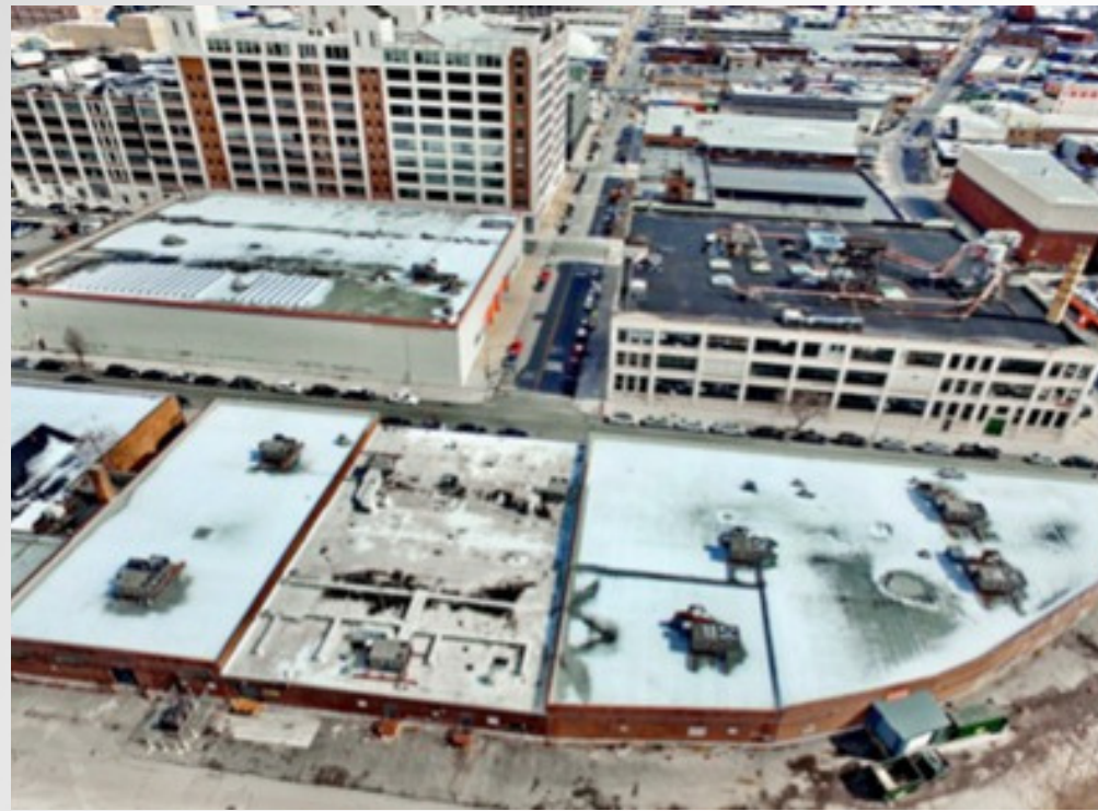
LONG ISLAND CITY, NY 52,000 SF Industrial Property